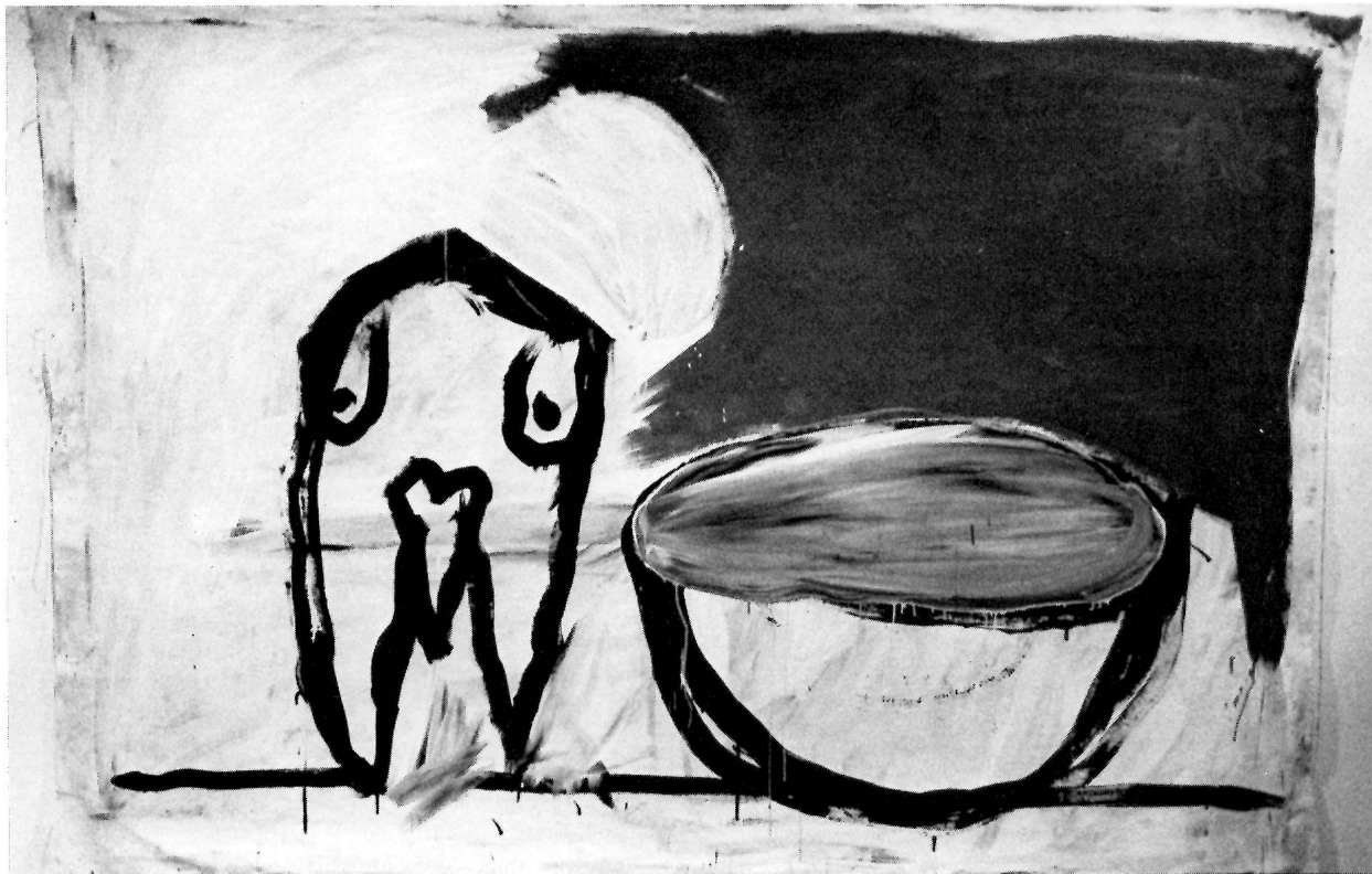
FRANK YOUNG: I Didn't Want To Know , 1985, Acrylic on canvas, 72 x 108"