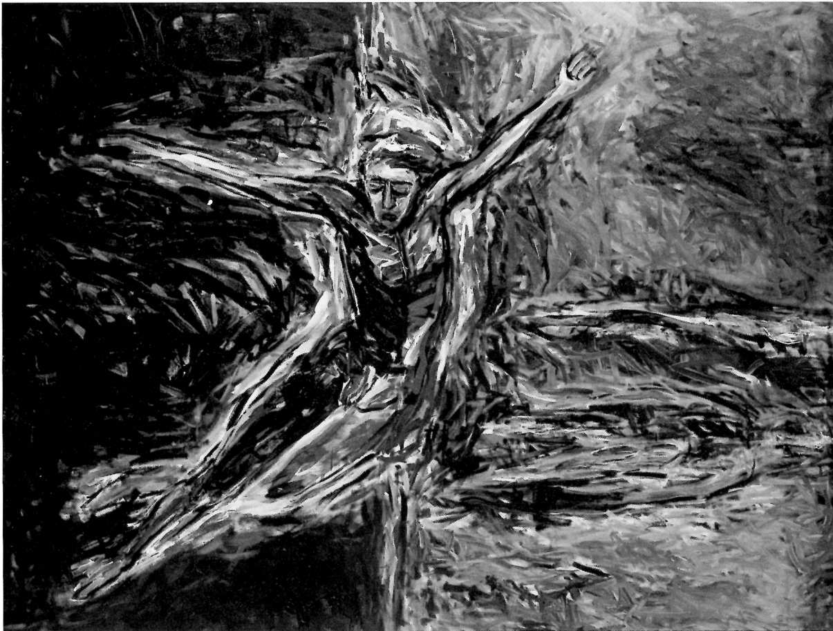
BARBARA SMUKLER: Mind Shadows , 1986, Oil on linen, 96 x 72"

shape of their heads both bone-structured and helmet-like. Usually no physiognomy is actually visible, but the wall-hung sculpture in this exhibition has two enormous hollow eyes which funnel back in the head to unfathomable depths. The creature is all head, the torso being tattered off into the air below the shoulders. It appears uncharacteristically vulnerable, like a wingless, legless insect. Unlike his curvilinear figure drawings which resemble battle scenes of some sort, his oil stick drawings of ranked "armoured" figures and their cowhide counterparts don't seem to have any source in art history and they are all the more effective as a result.