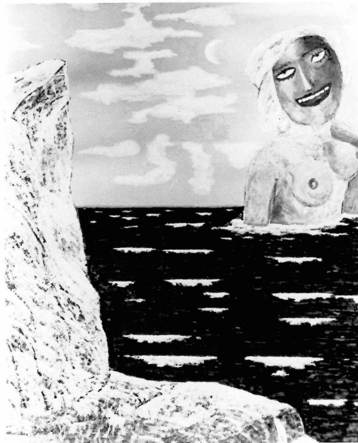
CARMEN CICERO: Provincetown Princess , 1984, Acrylic on canvas, 84 x 72"

End of a Dream is dominated by the large skull-head of a white-skinned simian creature who coldly and grimly surveys a brutal Crucifixion. Three vultures lurk in a tree at the left having finished picking the flesh off Christ’s purple bones — or waiting to do so. Kriesberg has said that “those dream images are meant to express some mystic order,” 5 but the violence of this image seems relevant to a time when political tortures, hostage-taking, and terrorist bombings abound. The brilliant hues and marvelous passages of his painting enable one to see the lighter side of the situation to some extent, though the humor is decidedly black. George McNeil once wrote of Kriesberg that he “exacerbate[s] form and color into ideational significance . . . [and] exploit[s] ambiguity, absurdity, and other psychological negatives.” 6 He might have been speaking of himself as well, of course, but he gets at the heart of Kriesberg’s acrid and penetrating style.