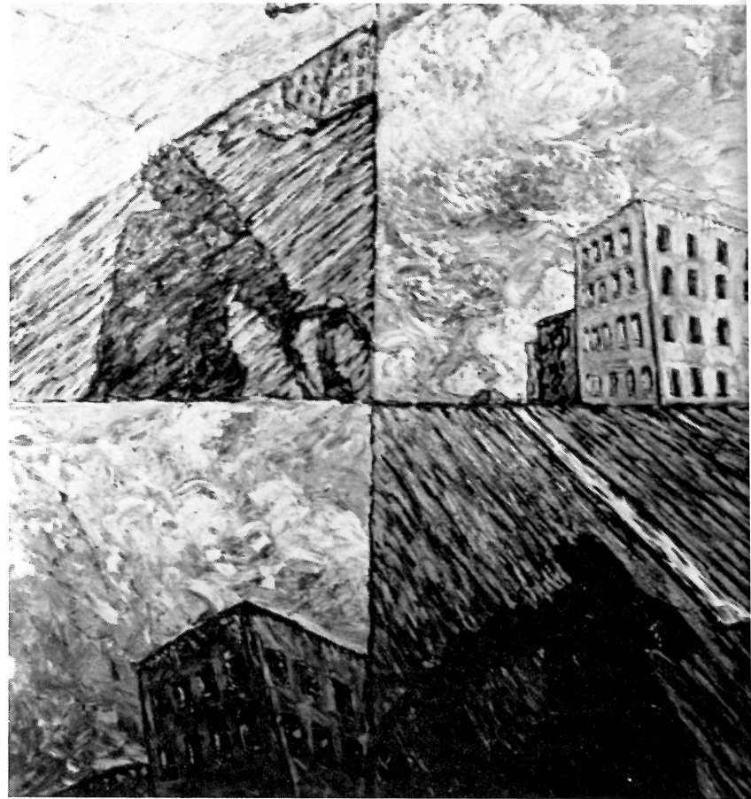
MICHAEL JED ROBBINS: Say You Saw Me on Shadow Street , 1981, Oil on canvas, 72 x 72"

It is characteristic of this youngest generation of artists that they admire the heroes of modern art who have been out of fashion until lately, in part because of their frankly expressionist and figurative styles. Lesley Dill, for instance, seems strongly inspired by Giacometti and even perhaps by Lynn Chadwick and Leonard Baskin. Dill's extremely flattened and emaciated figures like Man with Fin , a work constructed of paint over cement, have the same roughly-worked, gouged and graven surfaces as Giacometti's bronzes. She exaggerates the attenuation or