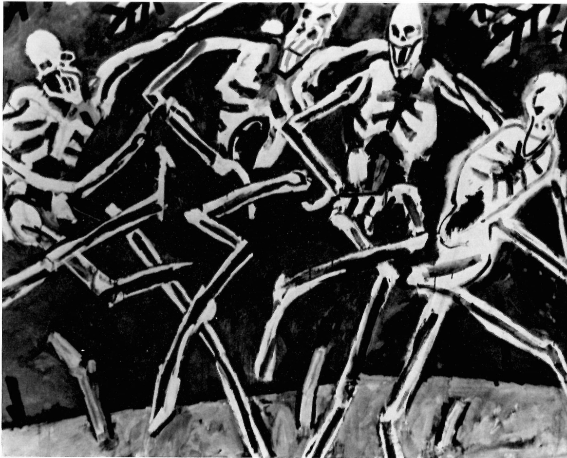
IRVING KRIESBERG: Red Dance , 1983, Oil on canvas, 66 x 90"

seems to hold the world, perhaps reality, at bay, while the mind seeks salvation in the realm of the unearthly, of imagination. (Does the hand relate to ancient native American mica hands and the handprints in pre-historic rock sanctuaries?) The figure seems poised on the edge of infinity, starry blackness a huge void behind. Immoderate Man also seems to be perilously perched on the edge of an abyss, this time a fiery red one. All around the edges of this flame-orange pit small figures clamor for him, entreat him, and jeer at him as if to either seduce or coerce him into temptation. One blue-headed fellow at top gives him the "high-sign" to follow him into perdition, but the Immoderate Man knows death awaits him there for his head is already a skull, wide-eyed with terror. It seems he has seen what price he has to pay for the things he has grabbed with his gigantic swollen, grasping arm. That arm, a perfect fusion of formal