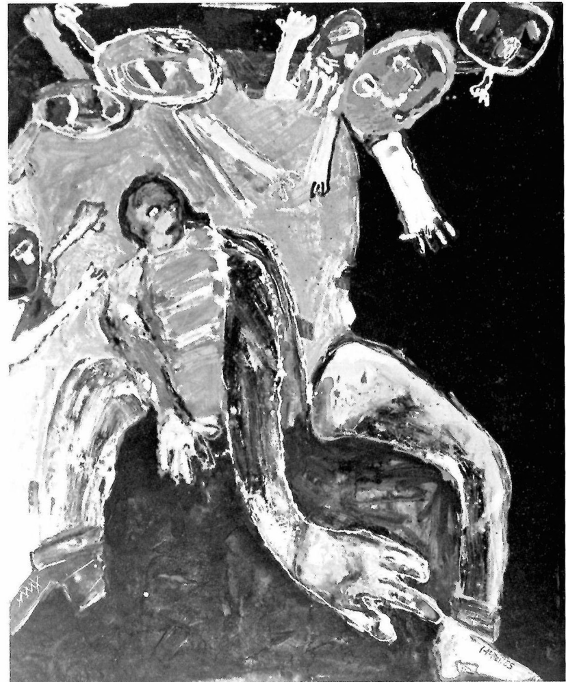
GEORGE McNEIL: Immoderate Man , 1985, Acrylic on canvas, 78 x 64"

The head of the figure in Waiting is grossly enlarged and twisted 180 degrees out of normal alignment. Encircled by colored dots and dashes like an electric halo, the head stares heavenward, as if searching for signs of deliverance. Center left a large hand flattened against the picture plane